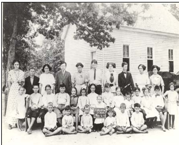
Corinth School, 1913 - One Room

Before these classrooms were able to get blackboards, the blackboards were just painted black squares on the wall.