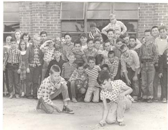
Below: South Street School was an elementary school for black students