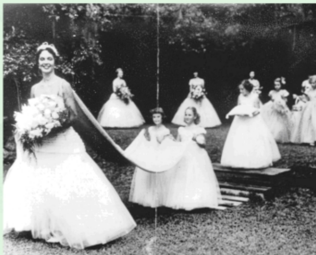
May Day queen and her court at Georgia State Womans College

(Text and photograph are from the May Day Exhibit at the Lowndes County Historical Society)