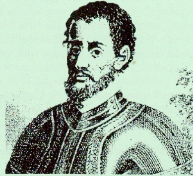
Engraving of Hernando de Soto. This engraving was done in the 1700s.

In 1539, Hernando de Soto and 600 men landed at Tampa Bay, Florida to explore the interior of North America. The coast had been explored by others including Ponce de Leon, but the interior remained unexplored.