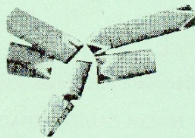
Nueva Cadiz beads were among the earliest type traded in the Americas.