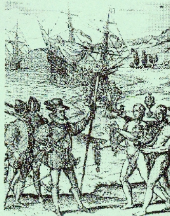
DeBry engraving of Columbus trading with the natives.

On Christmas Day, the men unloaded the cargo, assisted by the Arawak Indians. The ship was taken apart and used to build a settlement about one kilometer from where the ship sank. The settlement was called La Navidad because it was established at Christmas. Thirty-nine men stayed at the settlement and the rest continued with Columbus. When he returned on his second voyage eleven months later, the settlement and nearby Indian village was burned and the men were dead. Their supplies were found dispersed among the surrounding Indian villages. What actually happened at La Navidad remains a mystery.