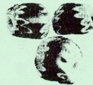
Beads like these chevron type are found in many sites visited by Hernando de Soto.

In October of 1539 the De Soto expedition established their winter camp at the town of Anhaica, an abandoned Apalachee Indian village (present-day Tallahassee, Florida). Here Spaniards would celebrate the first Christmas in the interior of the Southeast. Based on accounts and research by historians and archaeologists, it was not a "happy holiday." The Apalachee people were not pleased with the Spaniards presence and denied them food. The Spaniards at Anhaica were under siege—the Natives tried to burn the camp and the Spaniards did not leave the camp unarmed or alone.